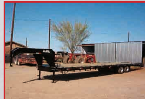
40 + 5 Tandem Dual