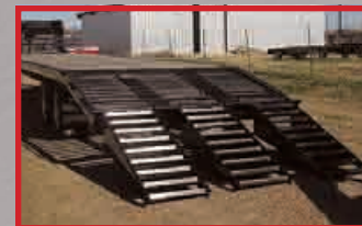
3rd Ramp Option