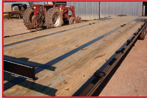
Flush Floors on Pierced Beam Trailers

Low Profile Gooseneck Trailers for Better Loading and less height. By piercing the beam it allows you to run the cross members through the beam 1 1/2" below the top of the beam. This allows the floor to be flush with the top of the beam, lowering the height of the trailer floor 4 1/2". Also we put 225 X 75R-16 tires on the trailer lowering it two more inches. These trailers are popular with equipment haulers. Low Profile trailers have the same specs as the tandem dual gooseneck trailers, except treadplate over the wheels to allow more tire clearance.