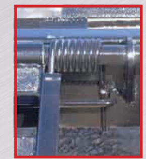
Spring Assisted Ramps