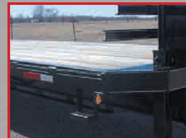
Step on Side for Easy, On/Off Access & Rubber Mounted Recessed Lights