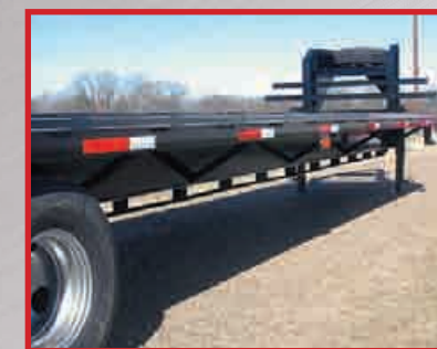
Bridging on Tandem Dual with Spare Tire 30' and Above (Option on Shorter Trailers)