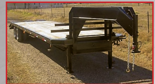
27 + 5 Tandem Dual