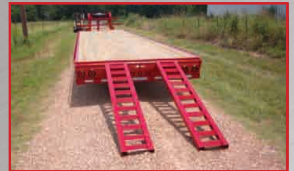
8' Ramp w/ Slide in Storage