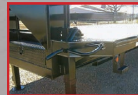
2 - Speed Jack Option