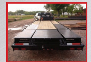
Plated Ramps and Pop-up