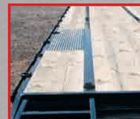
D-Ring Tie Downs