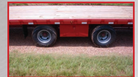
Spread Axle w/ Undermount Tool Box on Each Side