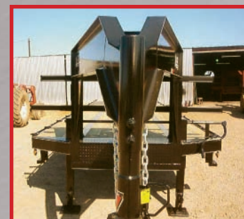
Coupler Safety Chains