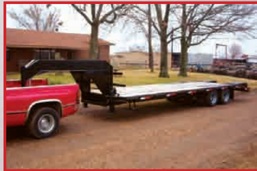
22 + 5 Tandem Dual