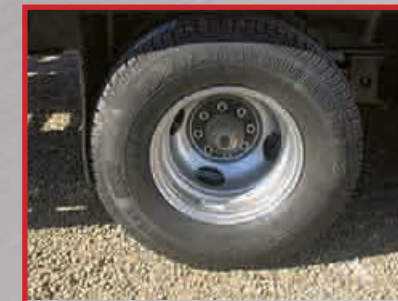
10-Ply Radial Tires