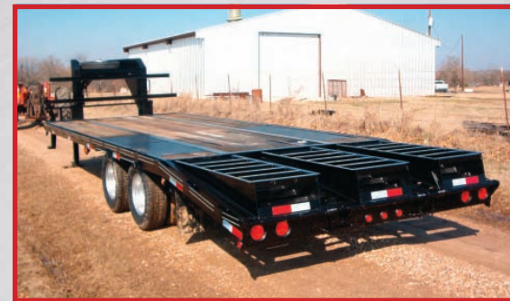
22 + 5 Tandem Dual