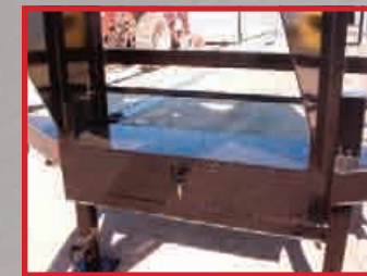
Locking Chain Rack