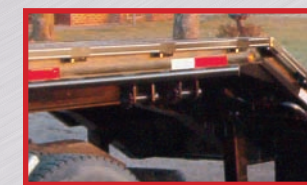
Slide Cargo Winches

Other Options Available but not Pictures are: