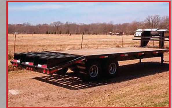
20 + 5 Tandem Dual