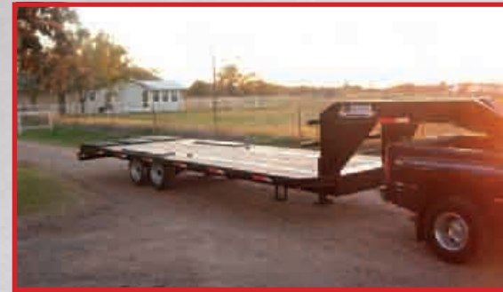
22 + 5 Tandem