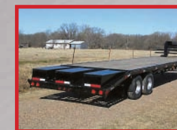
Diamond Plate on Ramps