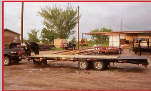
22 + 6 Tandem Dual